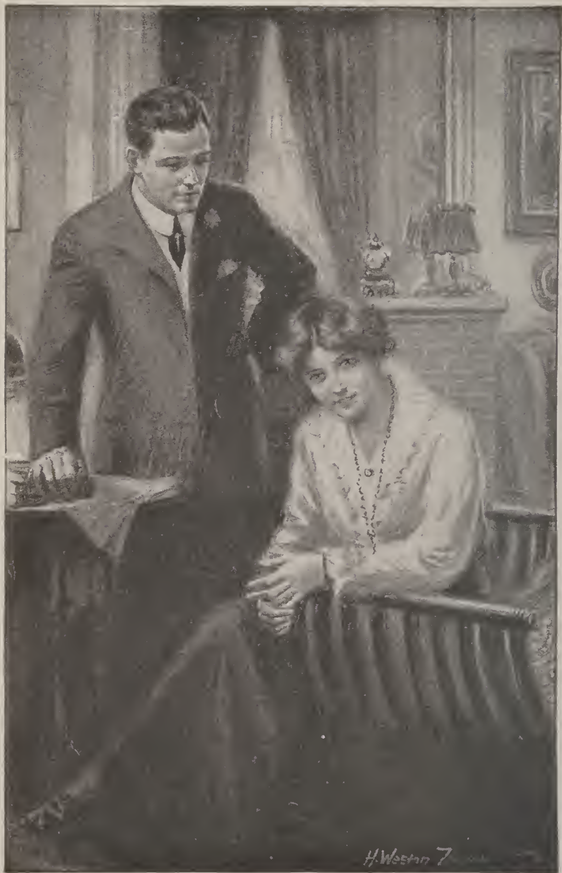
“JIMMY LOOKED DOWN AT THE WISTFUL, EAGER FACE.” (See page 184.)